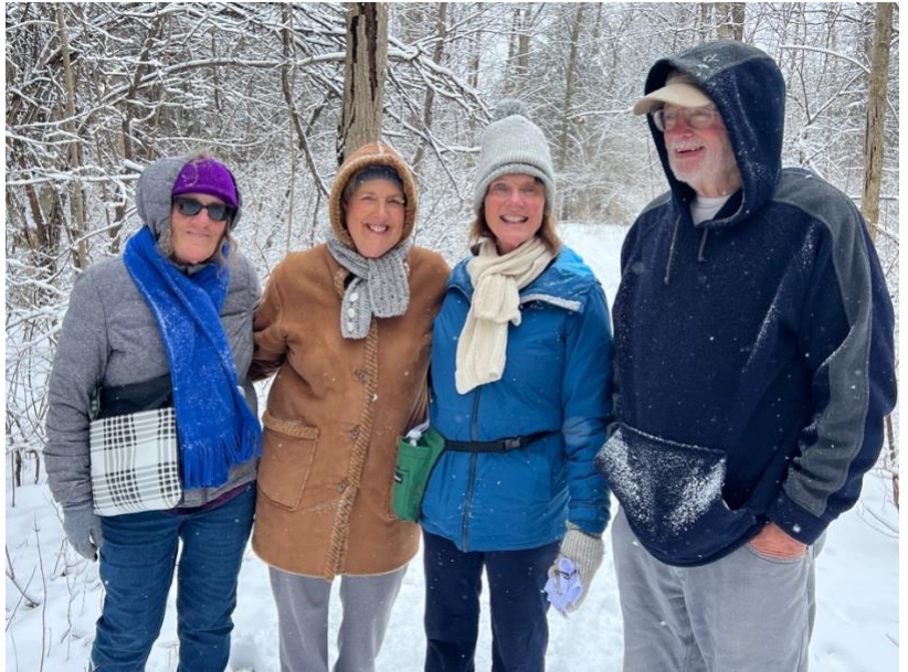
Folksmarchers enjoying the Manlius walk. ↑