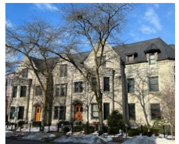
Historical architecture photos