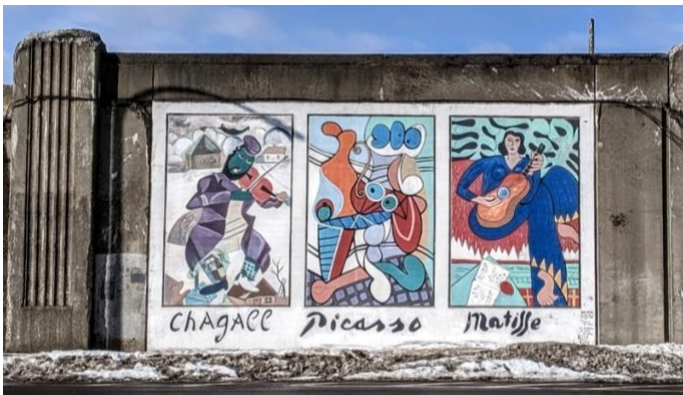
Some interesting art works, photos by Debbie Gunther.