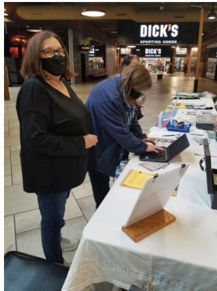
Former Folksmarchers returning in 2022