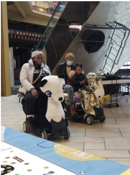
Family fun in the Destiny Canyon