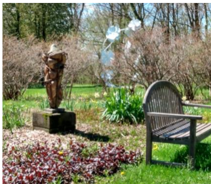
Art in the park.