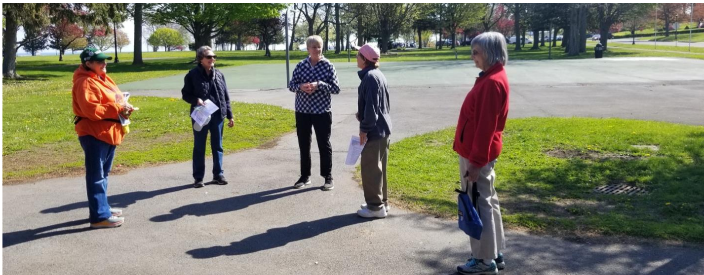
FM'ers keeping socially distant at Breitbeck Park.